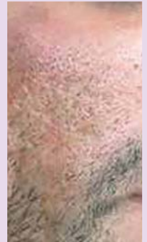
After 6 months