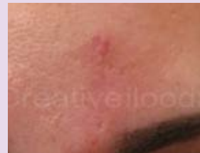
After 1 session