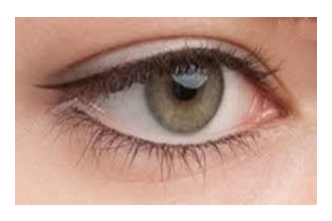
Bottom Eyeliner – Enhancement line – Black – number 1 needle Top Eyeliner – Medium line with flick – Black – number 3 needle