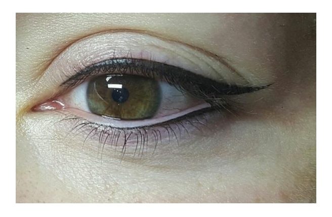
Bottom Eyeliner – Thin to Thick – Black – number 1 needle Top Eyeliner – Thick line with flick – Black – number 4 needle